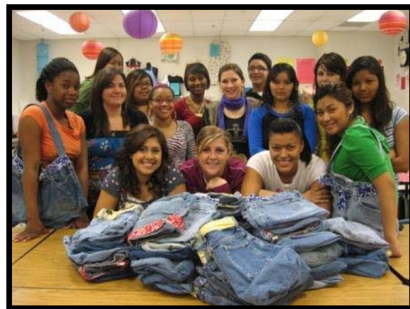
Sewers of the great Conference Jean Bags! Thanks Las Vegas High School & Elko High School!