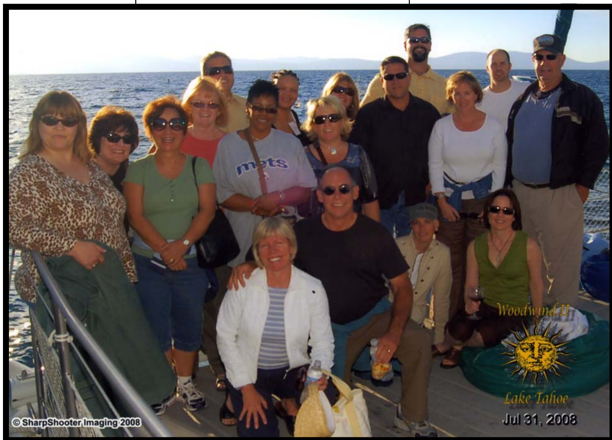
NACTE Members enjoying a cruise on Lake Tahoe at the 2008 Summer Conference

Check out 2008 conference photos at our website! nacte.org