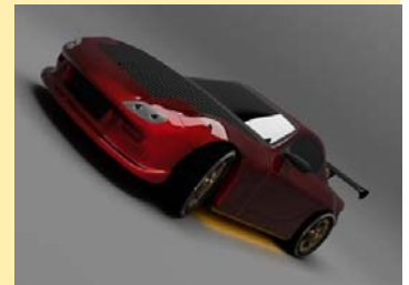
This car and the shoe-house were modeled and rendered in 3ds Max by students

esting will require a great deal of editing along with a good sense of timing. Most students choose to add music which must also be edited to match the pacing of the video. This capstone project simulates many