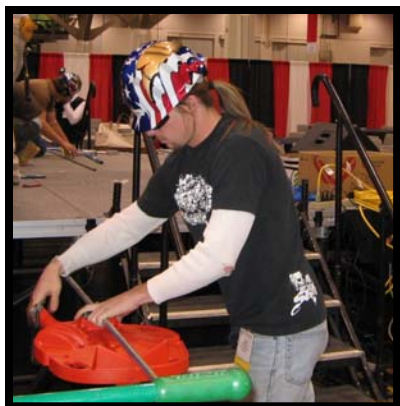
CCSD CTE students participating in student demonstrations