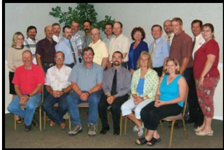
Ag Teachers 2005-2006

On January 13 and 14, the Nevada Agriculture Teachers' Association met at Great Basin College in Elko, Nevada, for their annual winter meeting. On Friday, teachers from all over the state worked diligently on Agriculture Education Record books and Supervised Agriculture Education projects for students. Students are required to develop an SAE to help identify an agriculture career path.